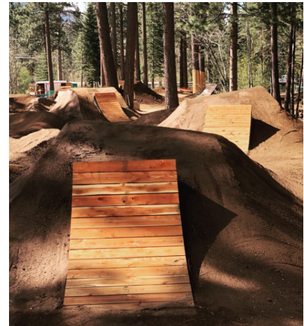
Bike Park Jumps

IVGID in partnership with the Incline Tahoe Foundation (ITF) and the Incline Bike Park (IBP) have come together in hopes of building a bike park in Incline Village, NV. This would build a community park for all age groups and abilities to enjoy. The Bike Park would be centrally located in town to allow users to ride their bikes to the park, instead of driving. As seen at other similar venues in the Tahoe Basin, bike parks are a family centered event that get folks out of their cars and can have a lasting impact on human health as well as improve air quality. This recreational project will have a lasting impact on the community with a low carbon footprint and a high return on investment.