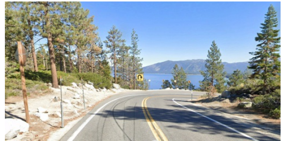
Route 89 Emerald Bay

On SR 89, near South Lake Tahoe, at 0.1 mile south of Eagle Falls Campground (PM 17.0). Install Closed Circuit Television (CCTV). EA 3J090