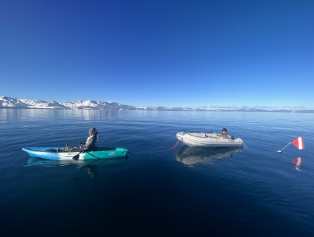
Surface support (kayak) and the litter raft following submerged divers (not pictured) while they collect underwater litter.

Project Fact Sheet Data as of 06/26/2024