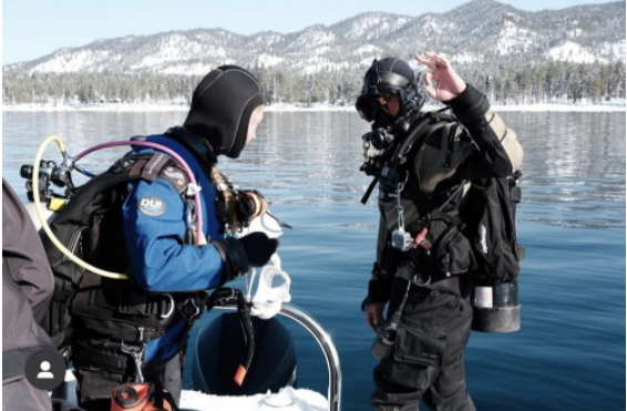
Volunteer divers communicating before submerging to pick up litter from one of the transects along the Nevada side of Lake Tahoe. Winter 2022-23

To further understand the litter accumulation patterns and movement below the surface of Lake Tahoe our goal is to investigate litter accumulations in bathymetric features such as localized basins, channels, and shelves along the Nevada shoreline between the depths of 70, 35, and 25 feet. We will use the findings to inform lakebed litter transport processes and litter loads within Lake Tahoe.