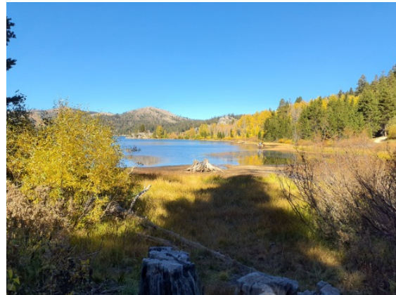
Fall color at Marlette Lake