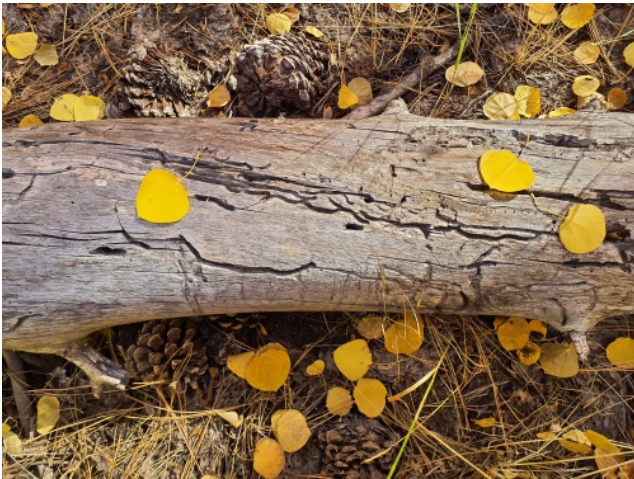
Poplar borer tracks in aspen log.