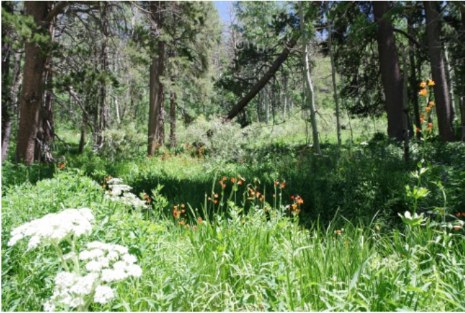
Wildflower meadow near Marlette Lake.