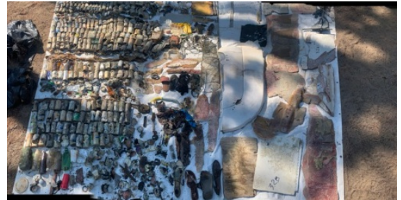
Litter removed from South of Sand Harbor

This pilot project was implemented to allow Clean Up The Lake to further investigate the submerged litter present below the surface of Lake Tahoe via SCUBA divers and a team of other volunteers. The skills, knowledge and procedures acquired through this pilot project will contribute to the success of the upcoming 72-mile Lake Tahoe SCUBA enabled clean-up.