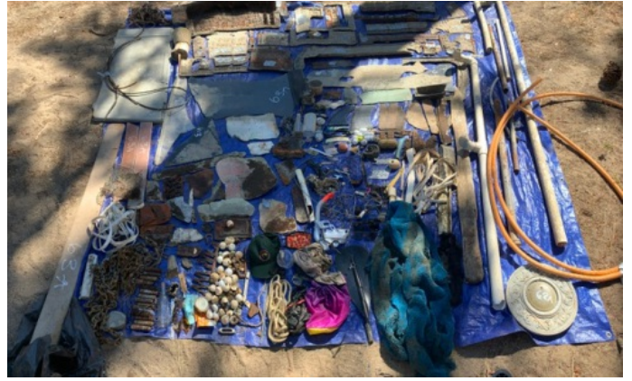
Litter removed from NDSL/NDEP clean up

Project Fact Sheet Data as of 11/15/2024