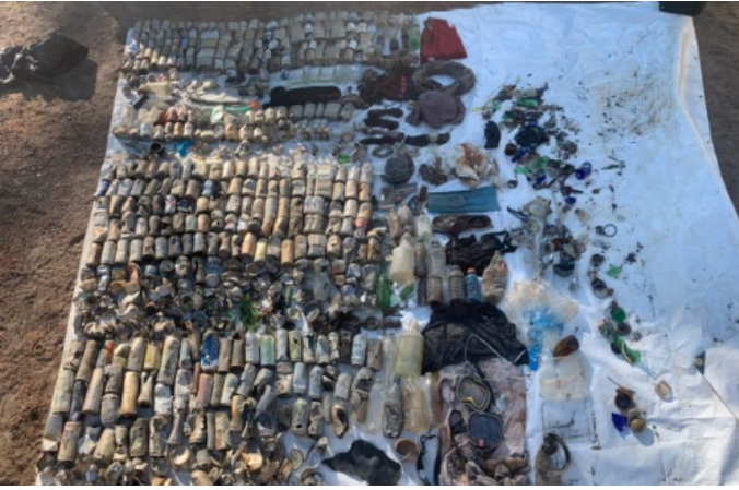
Litter removed from NDSL/NDEP clean up