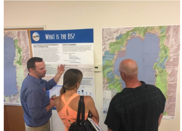
Shoreline Public Workshop