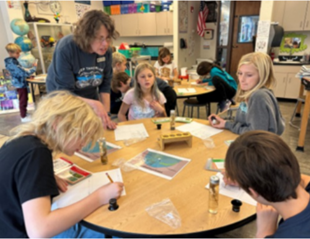
5th graders at Lake Tahoe School identify aquatic invasive plants.