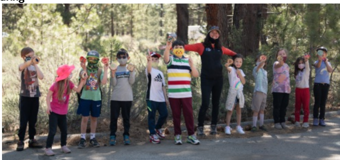
Reading Forest Field Trip at Taylor Creek