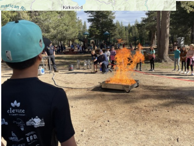
South Tahoe Fire and Rescue works with 5th graders.