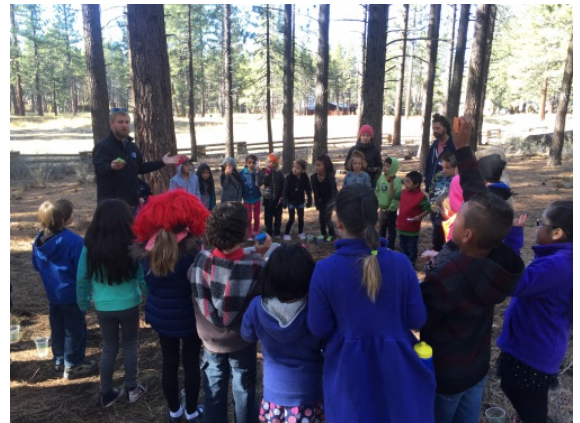
Bijou Stormwater Activity

The South Tahoe Environmental Education Coalition (STEEC) is a network of more than 20 local agencies and organizations that collaborate to bring environmental education resources to the Tahoe Basin. As stated in our mission and goals, STEEC is "dedicated to bringing high quality environmental education programs and projects to Lake Tahoe youth." STEEC has created and implemented new programs for Lake Tahoe Unified School District (LTUSD) schools, reaching thousands of students each year.