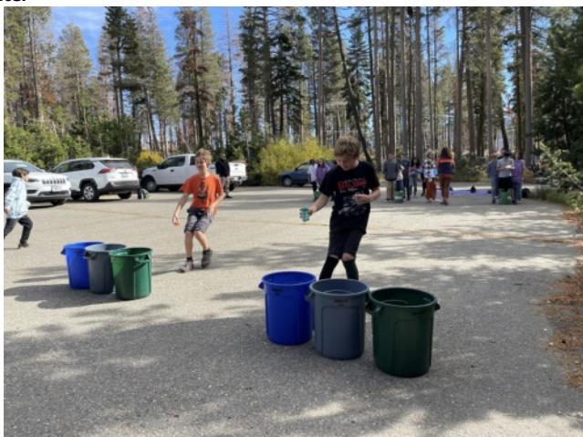
The South Tahoe Refuse Station's lesson involved a waste sorting relay race, which was a hit with the energetic students.