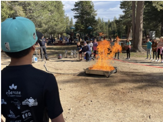
South Tahoe Fire and Rescue works with 5th graders.