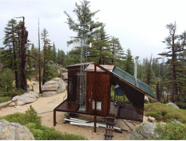
Air Quality Monitoring Station

Project Fact Sheet Data as of 07/12/2025