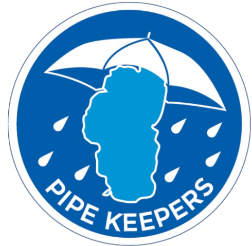
Pipe Keeper program logo

Pipe Keepers is the League’s citizen science program to address the threat of stormwater pollution entering Lake Tahoe. League staff train community members to report storm water infrastructure issues throughout the Tahoe Basin, collect stormwater samples during rain and snowmelt events and conduct restoration events at storm water infrastructure sites. Urban runoff from rain storms and snowmelt is the largest source of pollution that degrades Lake clarity. This information is used to help prioritize the most polluting pipes and find solutions so we can stop the pollution before it enters the Lake.