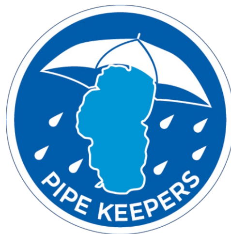
Pipe Keeper program logo