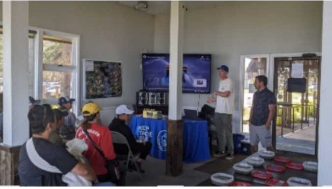
Tahoe RCD Staff presenting on the Tahoe Keepers Program at the 8/19/2023 Eyes on the Lake Training.

Project Fact Sheet Data as of 11/15/2024