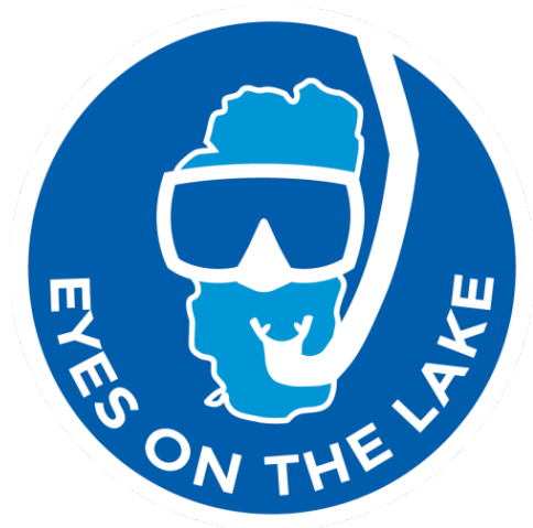
Eyes on the Lake program logo

Eyes on the Lake is a citizen science program to help prevent the spread of aquatic invasive species in Tahoe’s waters. League staff train community members how to identify and report on aquatic plants found while out enjoying the Lake. This information is used for early detection of new infestations followed by a rapid response to get treatment on the ground and stop these invaders in their tracks. Eyes on the Lake volunteers literally protect while they play at Lake Tahoe.