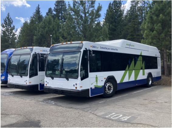
Gillig Hybrid Buses

This project covers the existing TTD transit service. Service focuses on moving residents, workers, and commuters. Carson Valley commuters can link to South Shore services at Stateline Transit Center and access businesses along the US50 corridor. Local service runs between the South Y Transit Center and Kingsbury Transit Center. The East Shore Express operates during summer months--linking Incline Village remote parking to the Tahoe East Shore Trail and Sand Harbor State Park. Paratransit service exceeds the requirements of the Americans with Disability Act (ADA) and serves the greater South Lake Tahoe area, including much of Meyers.