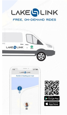
Lake Link flyer

Microtransit service started on the South Shore July 2022 and expanded in January 2024. The South Shore Transit Management Association contracts with Downtowner to provide the Lake Link service, with free rides between any location in the service area. The expanded service area extends from Round Hill in Douglas county, NV to the Sierra Tract neighborhood the City of South Lake Tahoe, CA. The first year was a success, averaging over 10,000 riders per month. In the first month of expanded service, ridership increased 84% compared to 2023 with over 24,000 riders. Microtransit reduces traffic congestion, improves quality of life for locals and the visitor experience, and reduces GHGs