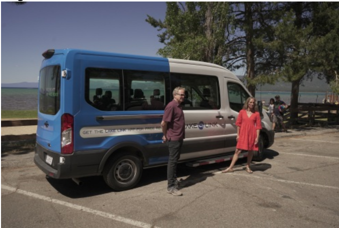
South Lake Tahoe City Councilmembers celebrate the launch of Lake Link service July 2022