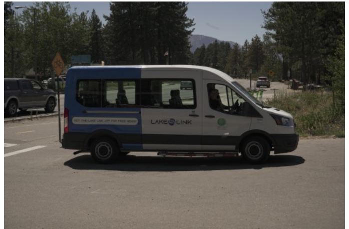
Lake Link shuttle in action