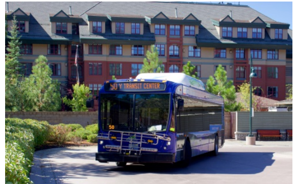
Hybrid bus at Stateline Transit Center serving Route 50

This project covers the existing TTD transit service. Service focuses on moving residents, workers, and commuters. Carson Valley commuters can link to South Shore services at Stateline Transit Center and access businesses along the US50 corridor. Local service runs between the South Y Transit Center and Kingsbury Transit Center. The East Shore Express operates during summer months--linking Incline Village remote parking to the Tahoe East Shore Trail and Sand Harbor State Park. Paratransit service exceeds the requirements of the Americans with Disability Act (ADA) and serves the greater South Lake Tahoe area, including much of Meyers.