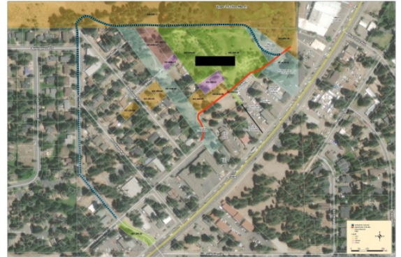
SLT Bikeway existing alignment and realignment concept in Link Road vicinity.

Relocate a section of the South Lake Tahoe Bikeway out of the Upper Truckee Marsh and into the adjacent uplands in the vicinity of Link Road and create a direct connection to Sussex Avenue. This project will allow for significant SEZ and Wetland restoration and formalize a heavily trafficked native surface route that is much more direct. The existing alignment was intended to be temporary until acquisitions were completed.