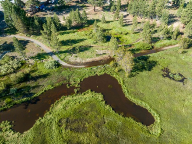
SLT Bikeway at Link Road. Spring 2023 inundation.