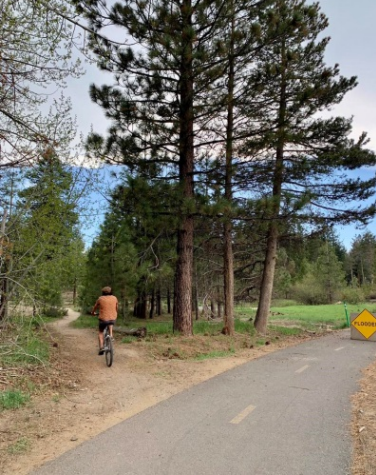
SLT Bikeway at Link Road. User-created trail to avoid flooded area and a significant detour.