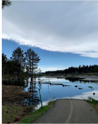
SLT Bikeway at Link Road in the Upper Truckee Marsh. Typical spring inundation.