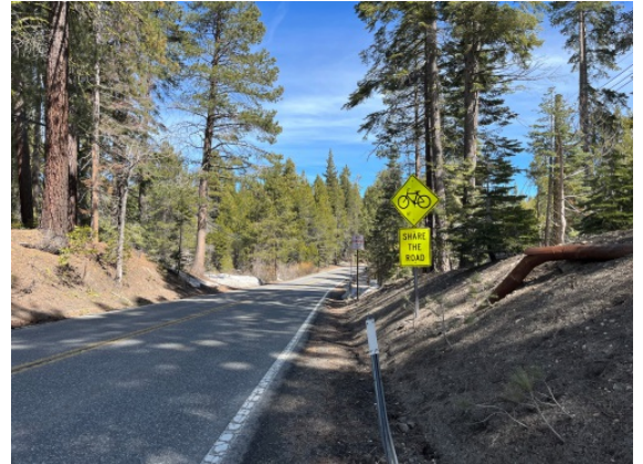
Looking Northbound on SR 89