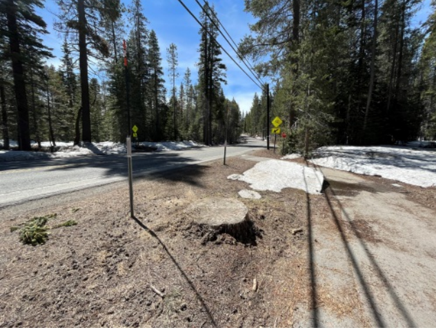
Trail Crossing SR 89