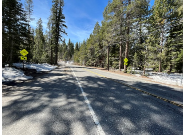
Existing Trail SR 89

Project Fact Sheet Data as of 06/06/2025