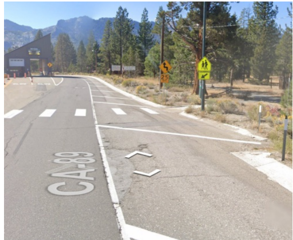
Refreshing the existing striping in US 50. Pedestrian signs will be relocated to US 50/Apache Ave Intersection.