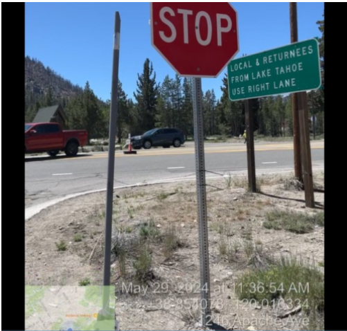
New HMA: New HMA walking path will be installed to US 50/ Apache Ave intersection.