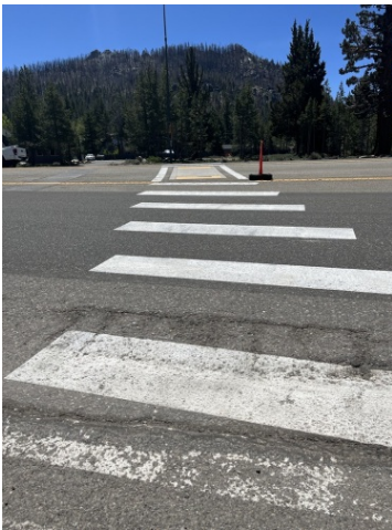
Existing Crosswalk will be removed that is located in US 50 close to California Agriculture Inspection Station. New crosswalk will be installed in intersection of US 50 and Apache Ave.