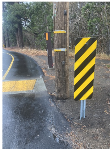
New object markers to identify hazards adjacent to the trail.