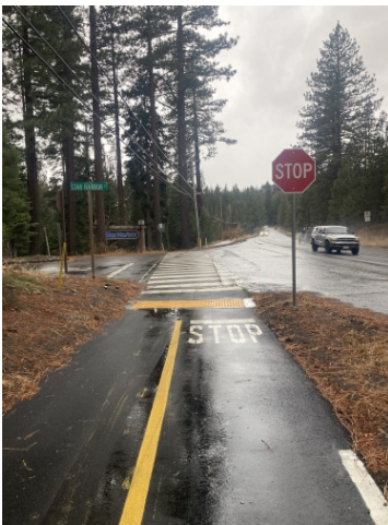
New ADA truncated domes, larger stop signs, and ladder-style crosswalk.