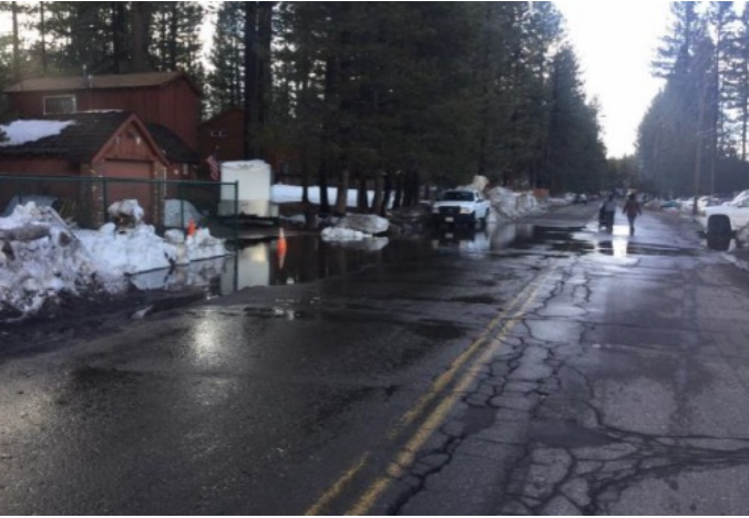
Pedestrian in travel way due to flooding of Blackwood road shoulder

Project Fact Sheet Data as of 05/17/2024