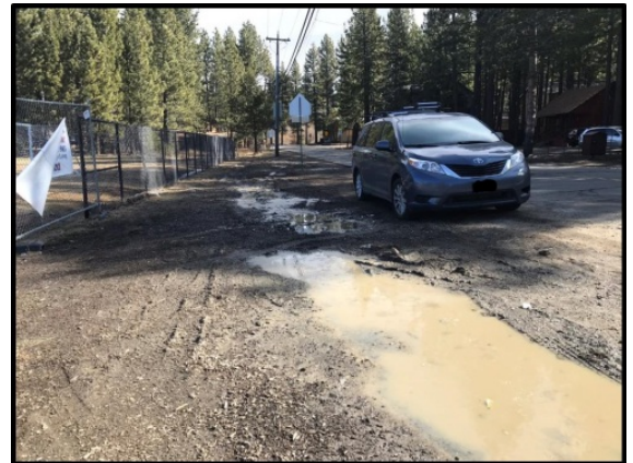
Flooding in parking and pedestrian access area