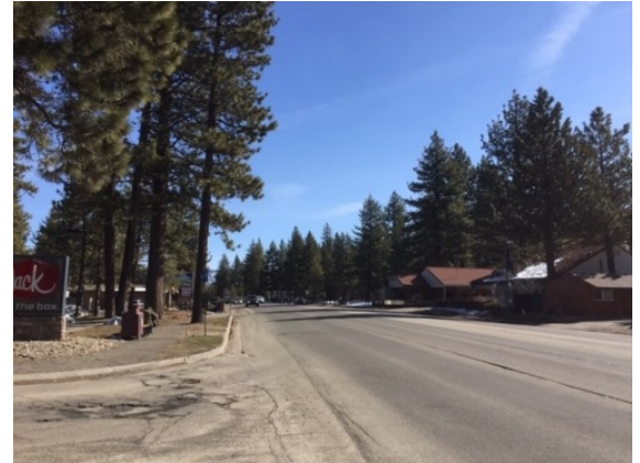
US 50 and Brockway Ave Intersection