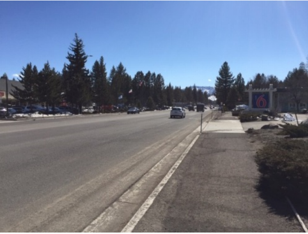
US 50 WB Before Construction

Project Fact Sheet Data as of 05/14/2024