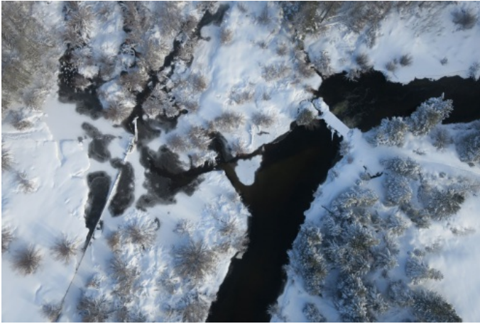
2017 winter, before runoff disconnected existing bridge