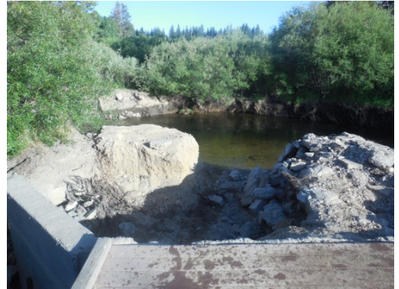
Summer 2017, bridge not connected to West side