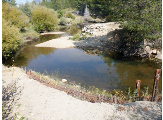
Sept 2020 photo from west bank of UTR towards existing bridge