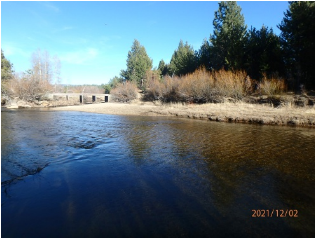
Above existing concrete bridge, view towards the north/downstream

Project Fact Sheet Data as of 05/18/2024