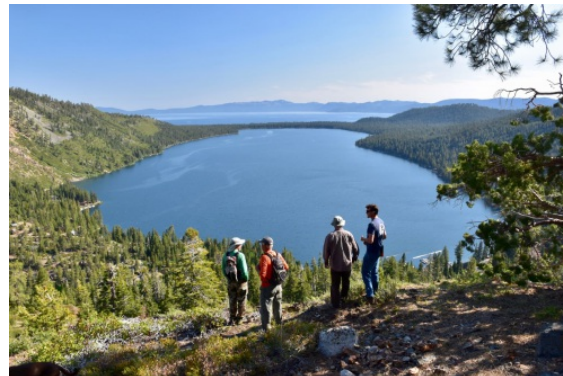
Lily Lake Trail