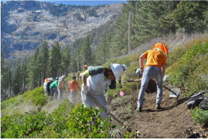
Volunteer work on Angora Ridge