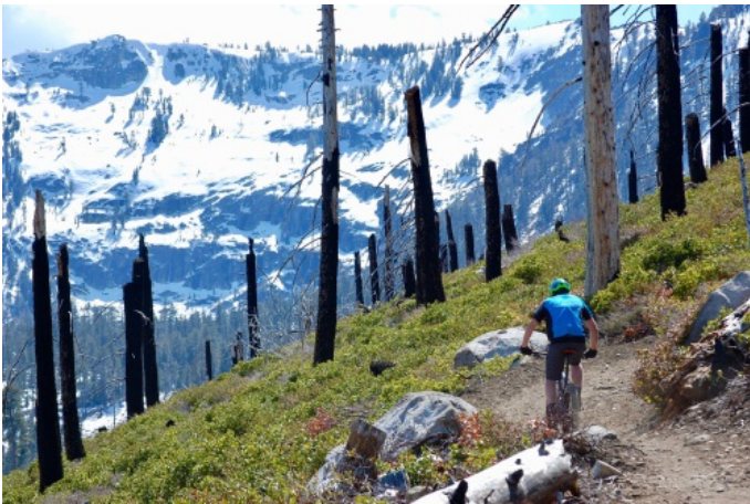
Angora Ridge Trail