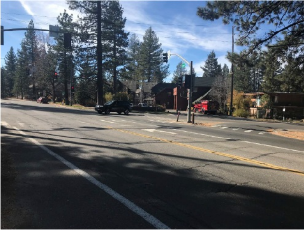
Project End - Pioneer Tr. and Ski Run Blvd. intersection looking south.