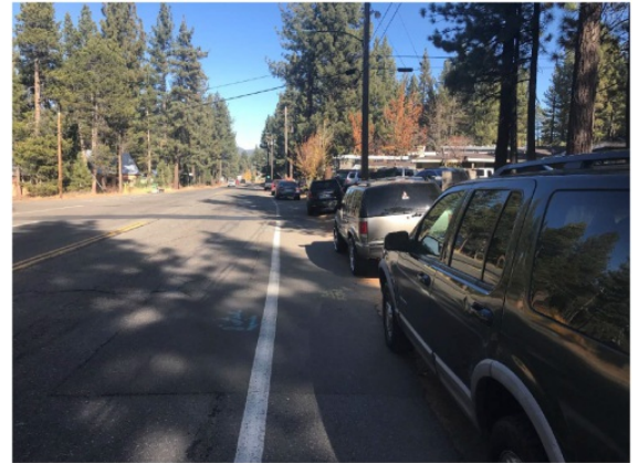
On-street parking near Sonora Ave. intersection looking north.