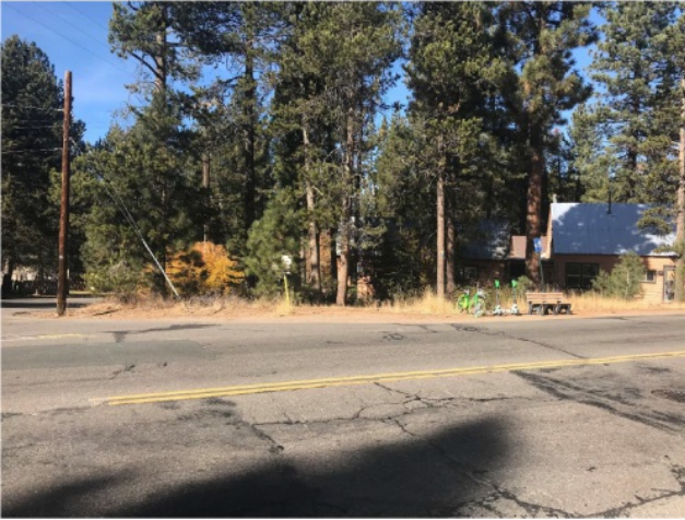
Existing bus stop near Sonora Ave. intersection.