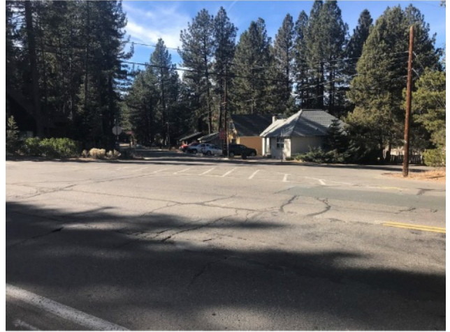
Pioneer Tr. and Sonora Ave. intersection looking west.