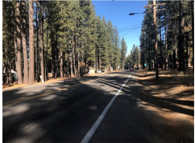
Pioneer Tr. right-of-way looking north near Ski Run Blvd.

Project Fact Sheet Data as of 05/18/2024