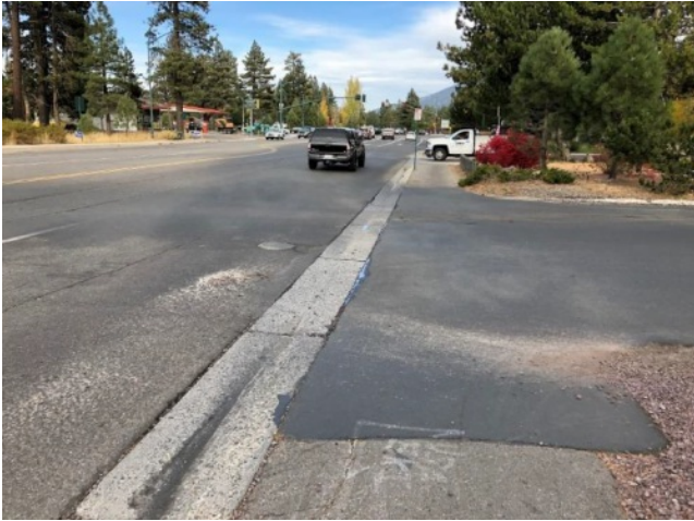
Preexisting Condition 5