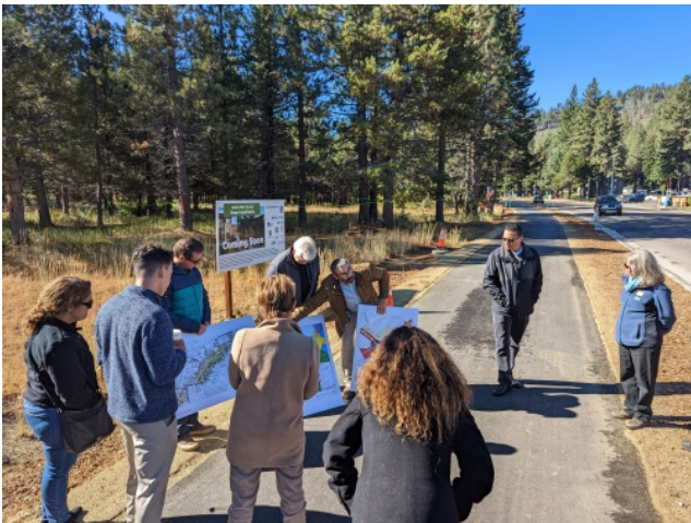
CTC visits Lake Tahoe Blvd. Trail