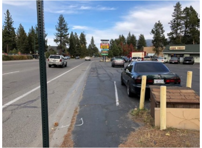
Preexisting Condition 4