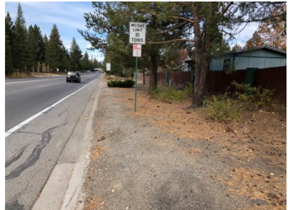
Preexisting Condition 1

Design and construct Class 1 bike trail, ADA compliant ramps, and pathway lighting along the 0.6 mile section of Lake Tahoe Blvd. from the Intersection of Viking Way (D-Street) to the intersection of State Hwy 89 and US Highway 50 (South Wye). Note: Project name was updated from "Viking Way to Lake Tahoe Blvd. Class 1 Bike Trail" on 11/23/16 for consistency with the name CSLT used to apply for CMAQ funds.