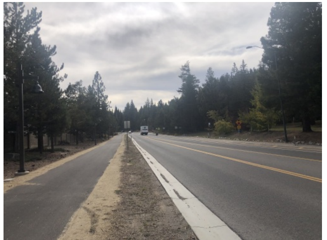
Post Construction with Completed Streetlights