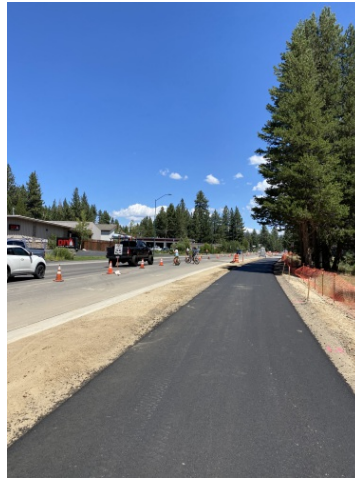
Trail Construction (Looking north in front of future Sugar Pine Village site)