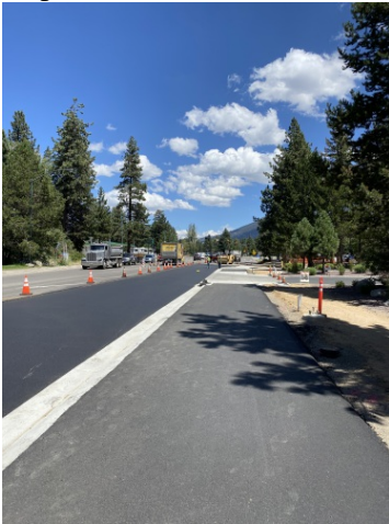
Trail Construction (Looking toward South Wye Intersection)