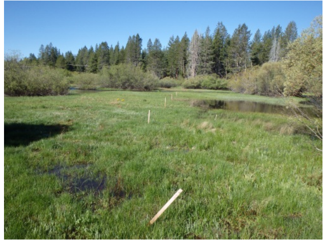
Trout Creek bridge alignment