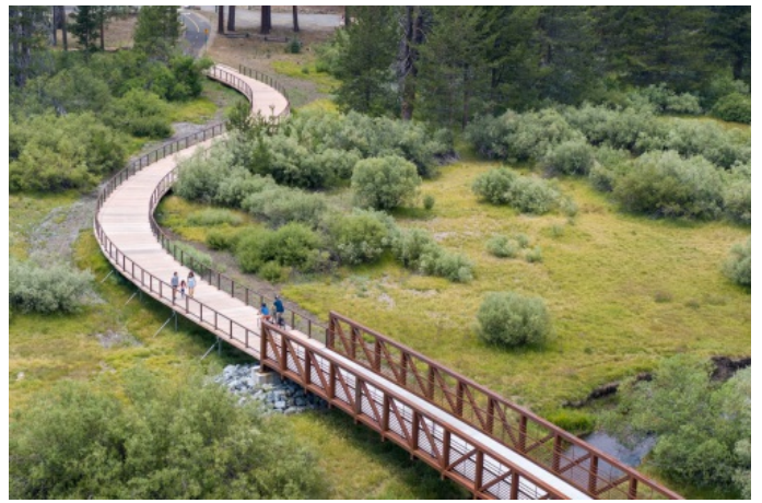
Dennis T. Machida Trail Trout Creek crossing