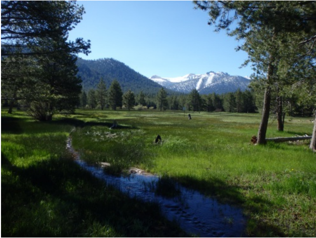
Bijou Meadow alignment