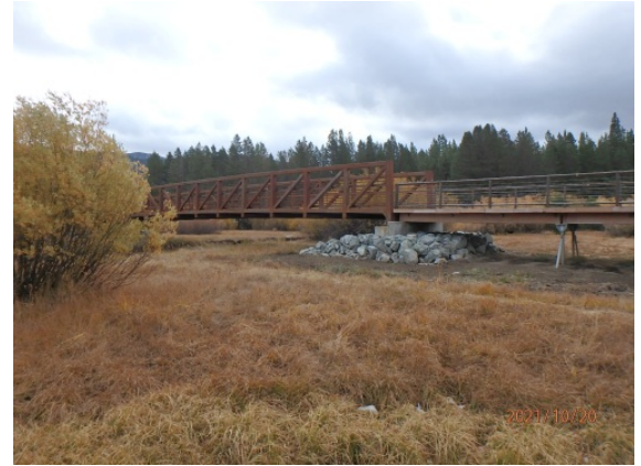
Bridge and boardwalk at Trout Creek

Completed and open to the public in fall 2021, the South Tahoe Greenway Shared Use Trail Phases 1b & 2 is the second implementation phase of the entire Greenway project, now named the Dennis T. Machida Greenway Memorial Trail. It expands on the existing bicycle network and connections in South Lake Tahoe. The approximately one mile shared use trail between Glenwood Way and Sierra Blvd, includes an elevated boardwalk near Trout Creek and Bijou Creek. A new bike bridge over Trout Creek, improves local street crossings, and connectivity to nearby amenities.