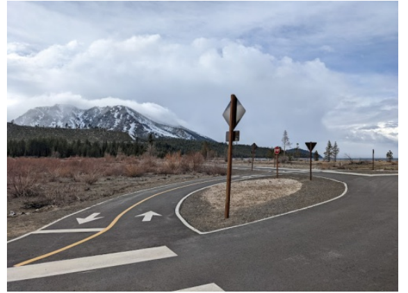
Bike path at roundabout

Construct roundabout between parking areas and provide non-motorized path to beach amenities.