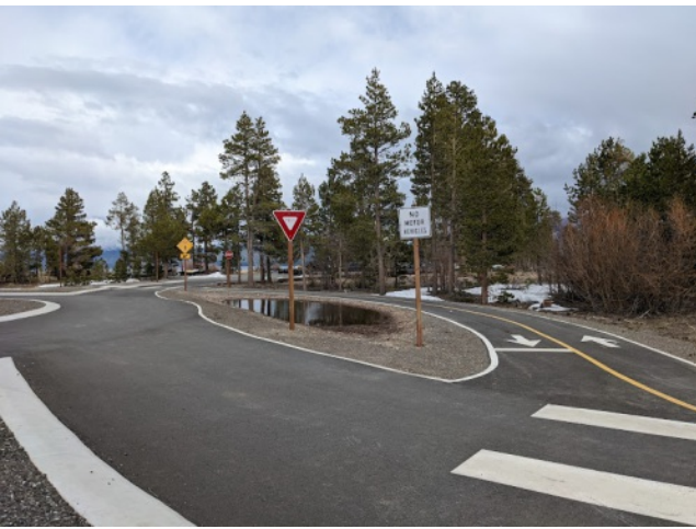
Bike lane at roundabout facing east lot