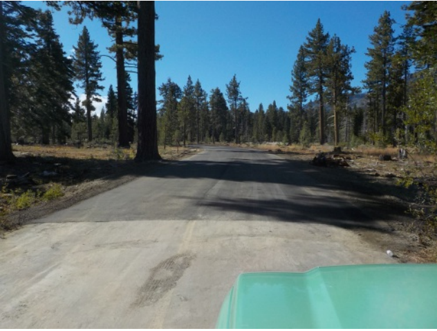
view of reconstructed road