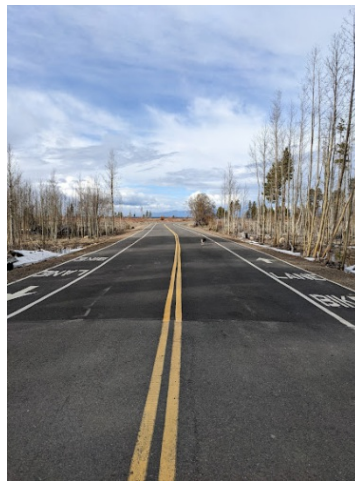
Bike lane between entrance station and roundabout