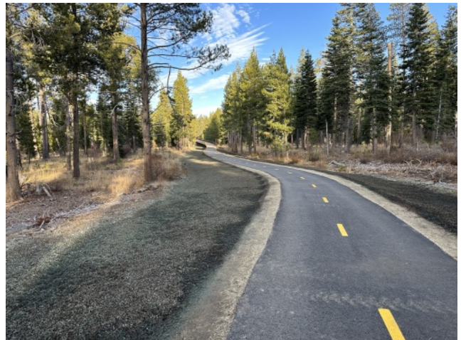
View to the east towards the Upper Truckee River.