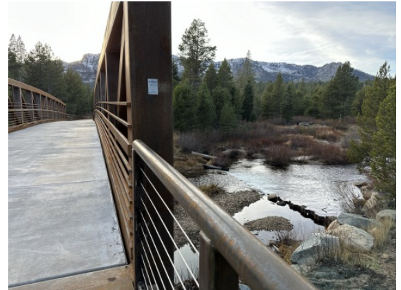
At the bridge over the Upper Truckee River, view to the east

Open to the public in fall 2023, the Class I shared use path between West San Bernardino Ave and East San Bernardino Ave provides a connection over the Upper Truckee River and provides access to Washoe Meadows State Park, Tahoe Paradise Park, and the Meyers Elementary School in the community of Meyers. The project links the bike lane facilities along North Upper Truckee Rd from the west and Apache Ave to the east via a Class 3 (bike route) through signage along West San Bernardino Ave and East San Bernardino Ave.