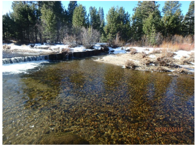
View in the southwesterly direction across the Upper Truckee River, near 38.8574, -120.0270.