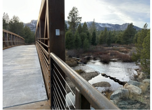
At the bridge over the Upper Truckee River, view to the east