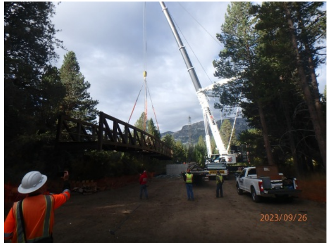
Set bridge, September 26, 2023