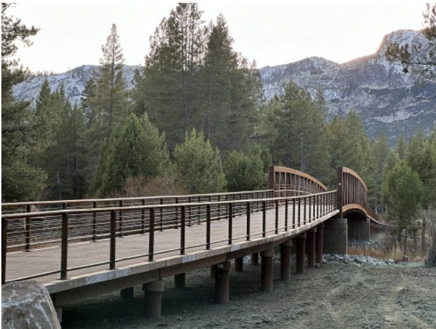
From Tahoe Paradise Park