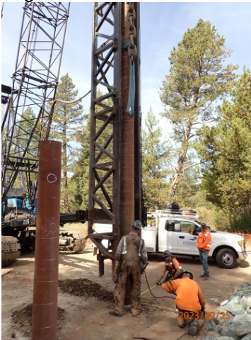
Steel pipe pile driving, foundation supports for the precast concrete boardwalk system, September 25, 2023.