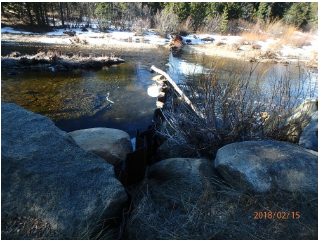
View in the westerly direction across the Upper Truckee River, near 38.8573, -120.0269.