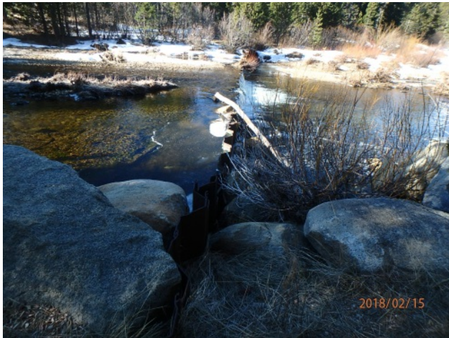
View in the westerly direction across the Upper Truckee River, near 38.8573, -120.0269.