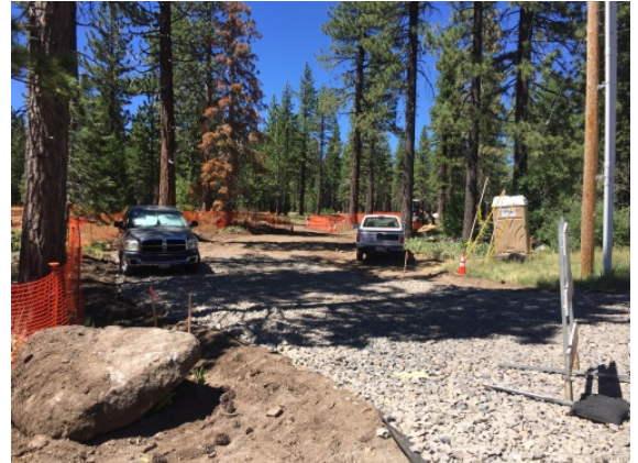
Construction Summer 2017