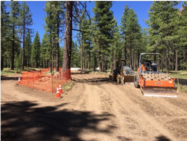
Construction Summer 2017