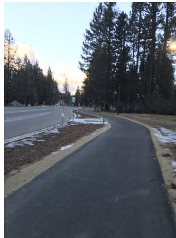
Al Tahoe Blvd Mobility & Safety Project Class 1 Bike Trail with Bus Stop