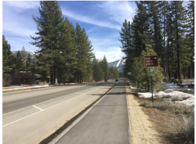
Upgraded ADA Compliant 6' Sidewalk Completed 2017 at USFS frontage