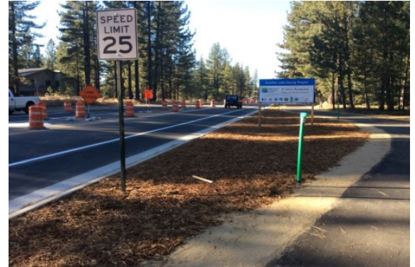
Post Construction - Al Tahoe Blvd WB New Class 1 Path