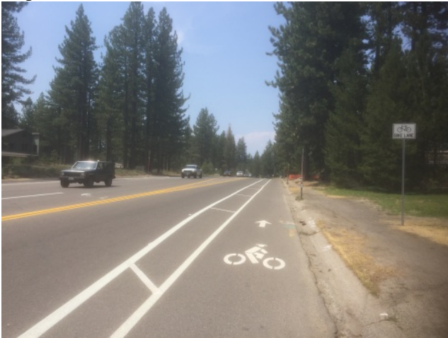
Al Tahoe Blvd westbound lane Pilot Project Re-striping Class II buffered bike lanes