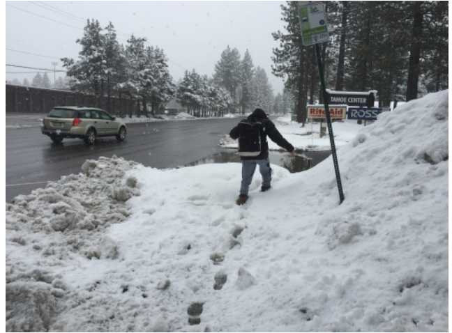
Existing Bus Stop at Rite Aid/Ross Winter Access and Flooding Issues