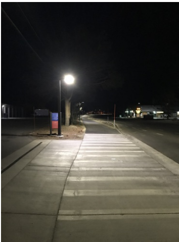
Al Tahoe Blvd Mobility & Safety Project Class 1 Bike Trail Streetlight at Bus Garage Driveway