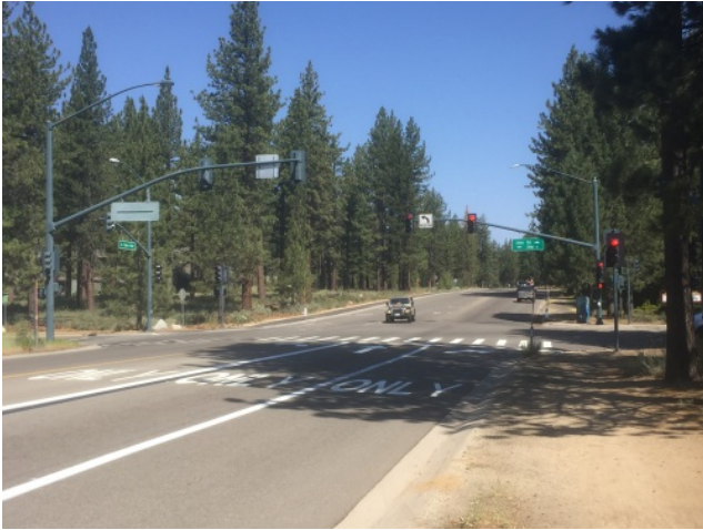
Johnson and Al Tahoe re-striping 2017