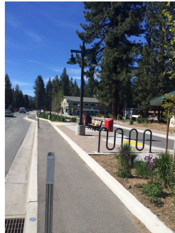
Lake Tahoe Boulevard & Harrison at Bus Stop