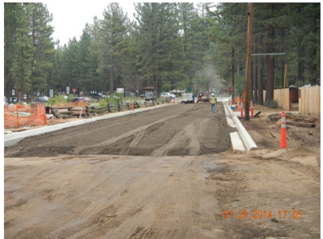
Sub-base Preparation for Paving-Merced Ave.