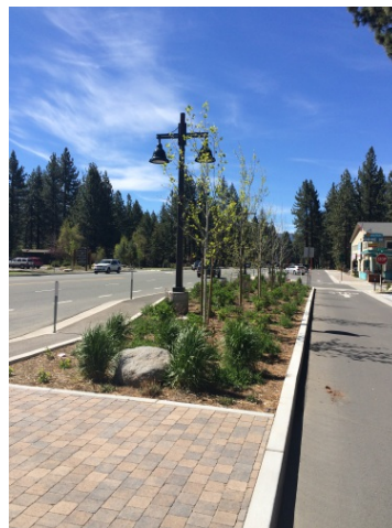
Harrison at Modesto