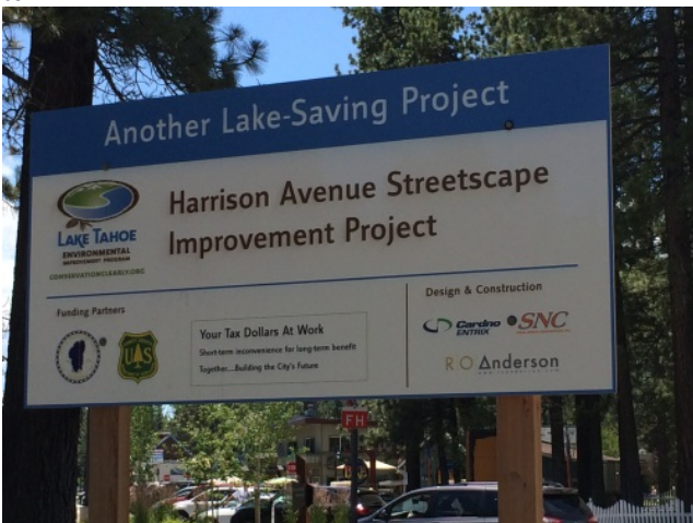
Harrison Avenue Project Sign