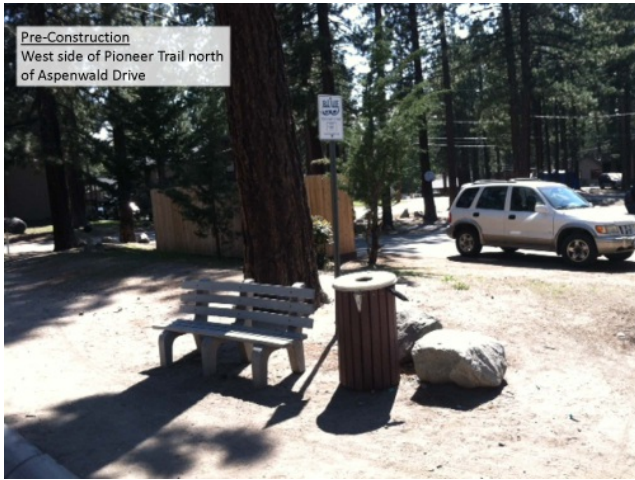
Pioneer Trail before pedestrian improvements