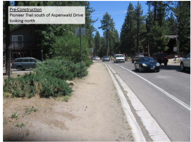
Pioneer Trail without pedestrian improvements