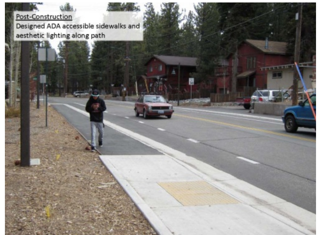
Pioneer Trail with pedestrian improvements