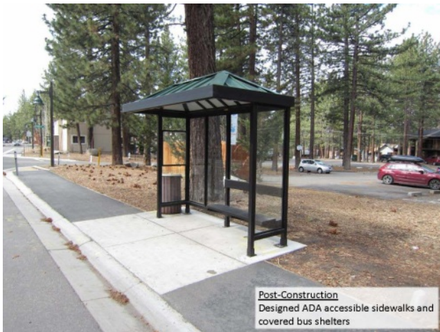
Pioneer Trail bus shelter after project