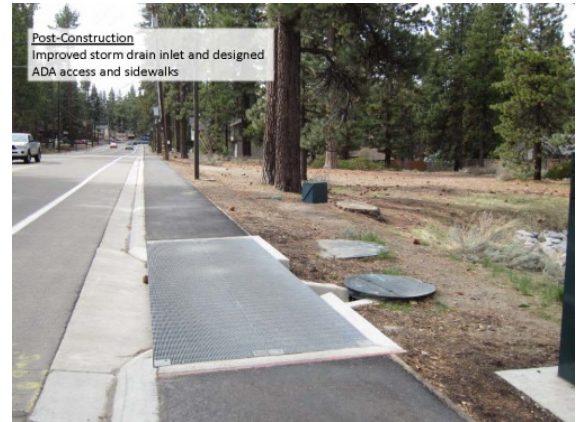
Pedestrian Improvements along Pioneer Trail