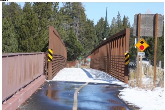
Bicycle/Pedestrian Bridge over the Upper Truckee River at Sawmill

Project Fact Sheet Data as of 12/03/2024