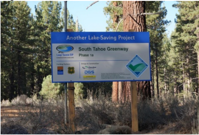
Greenway Phase 1a Project Sign