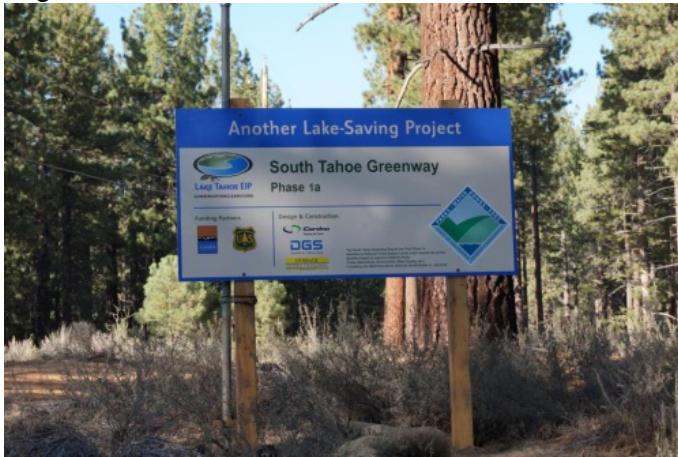
Greenway Phase 1a Project Sign