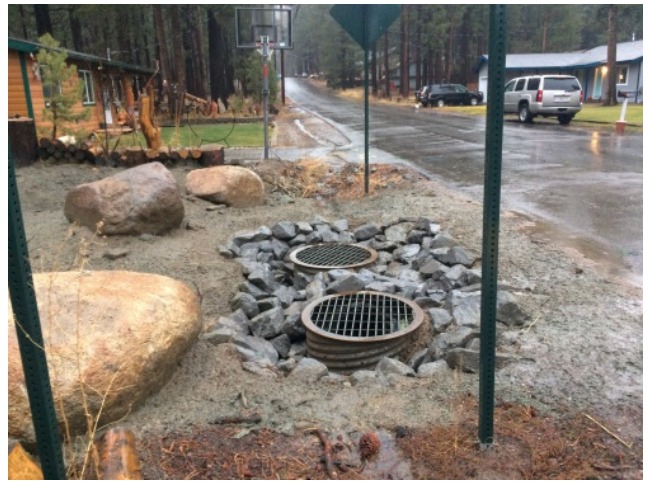
Becka Drive Drainage