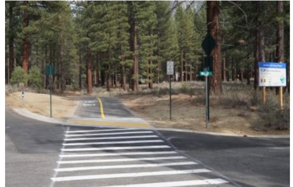
Greenway Bike Trail at Walkup

The initial construction phase of the South Tahoe Greenway Shared Use Trail (Greenway), Phase 1a, extends 0.42 miles between Herbert Avenue and Glenwood Way in the heart of the Bijou neighborhood in South Lake Tahoe. Preliminary planning refinements began in 2012 and initial construction occurred in 2015. In 2017 additional project drainage infrastructure was constructed. The next implementation phase of the Greenway, Phases 1b&2, will extend the trail connection south to the Sierra Tract and is described as a separate EIP project.