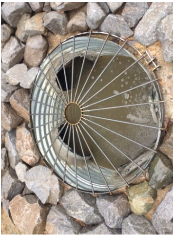
Additional Drainage Infrastructure