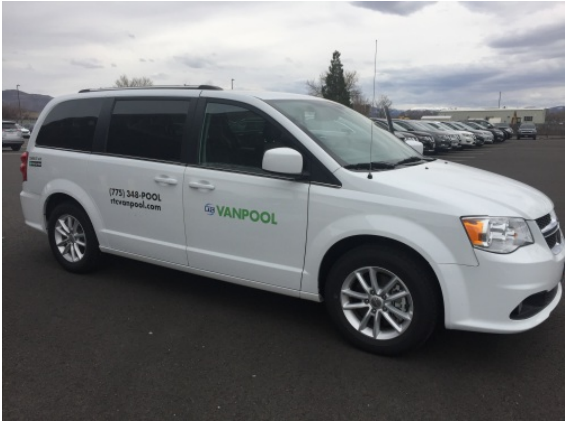
Image of vanpool vehicle.

The Truckee North Tahoe Workforce Vanpool Program offers subsidies for Commute with Enterprise vanpools, helping employees commute to work in Eastern Placer County. Groups of individuals who live and work near each other and have similar schedules can rent a van at a reduced rate and carpool together. The program provides an $800 monthly subsidy per vanpool, with additional subsidies available through other programs depending on the vanpool's origin.