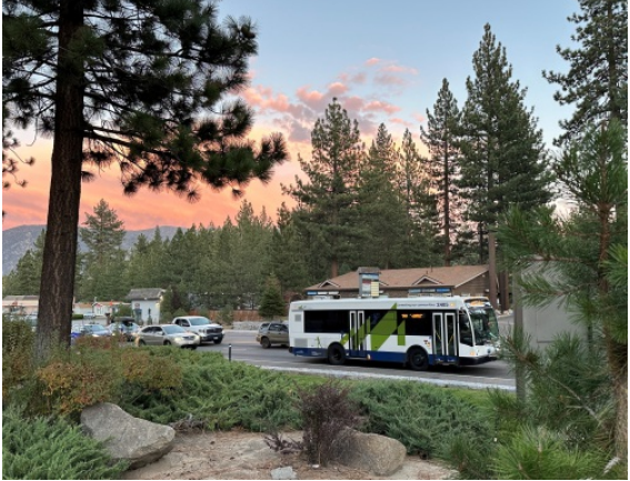
Example of newer bus

This project consists of preventive maintenance; enhancements to transit services, such as street furniture replacement and expansion; improved Management Information Systems; IT enhancements, such as cable and fiber access; ADA improvements; and safety & security enhancements. This project includes the purchase/replacement of 10 buses at a cost of $10,000,000 and may include other fleet vehicles and/or related equipment. The buses will be a mix of battery electric and clean hybrid-diesel.