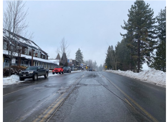
Looking Eastbound at the Bike Lane.