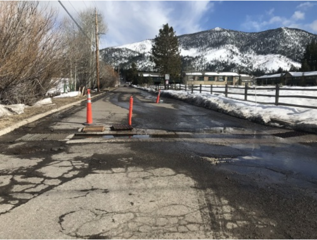
End of Kahle Drive drainage and pavement issues