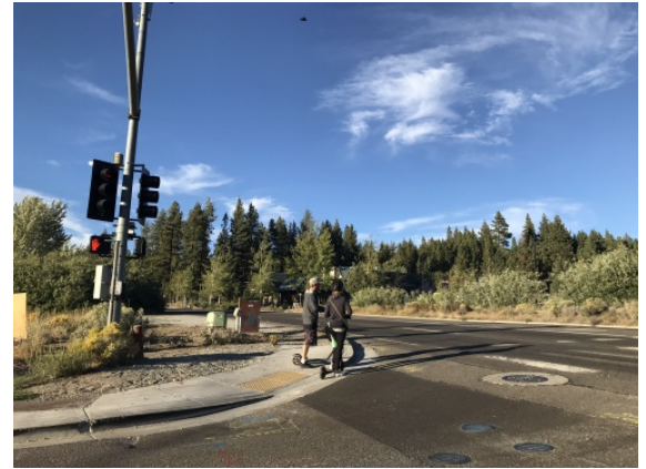
Intersection of Kahle and US-50 is a safety issue for peds and other users.