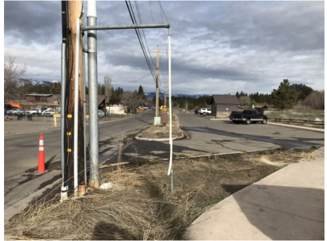
Overhead power lines and groundwater drainage issues plague Kahle Drive