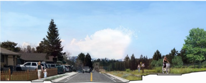
Vision for Kahle Complete Street