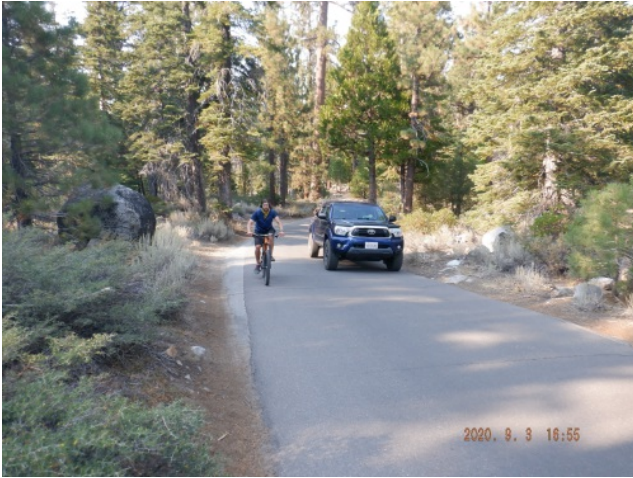
Fallen Leaf Road: Bike and Vehicle Use