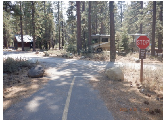
Existing trail end at Fallen Leaf Campground