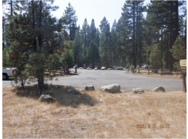
Fallen Leaf Road at Campground

Project Fact Sheet Data as of 05/15/2024