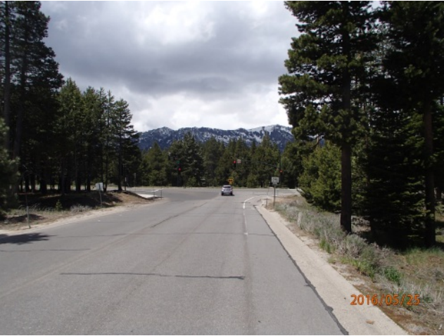
Westerly on westbound Pioneer Trail towards US Hwy 50