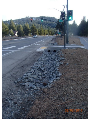
Pioneer Trail signal at crosswalk