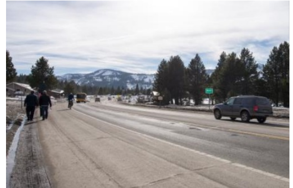
Along US Hwy 50/ State Route 89, south of Pioneer Trail