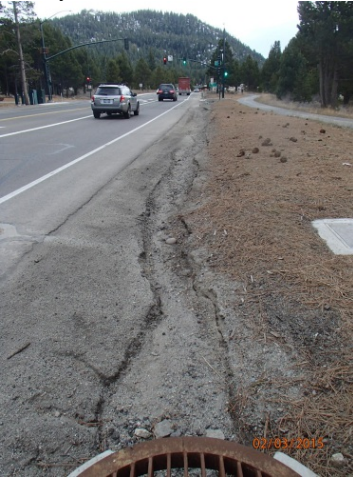
Pioneer Trail signal, looking towards Meyers