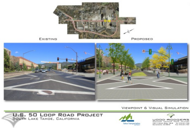
Project concept drawing