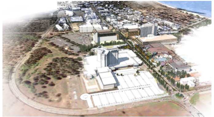
Concept of proposed Project area improvements