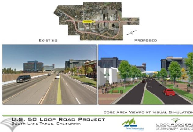
Project Concept Drawing