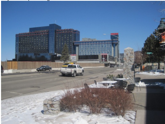
Existing US 50 Photo looking North