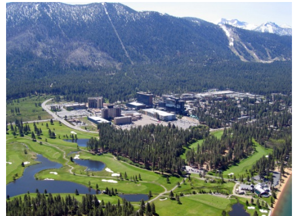
Project Area Aerial Existing Conditions