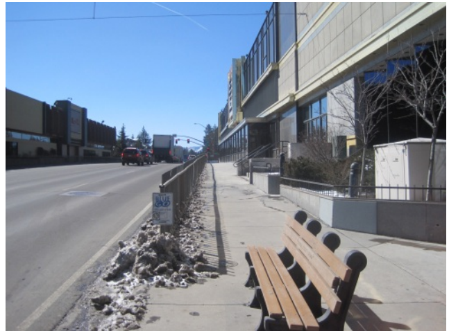
US 50 Existing Bike/Ped facilities

Project Fact Sheet Data as of 06/06/2025