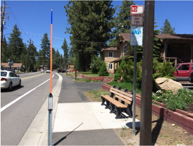
Existing bus stop replaced with new shelter (3)