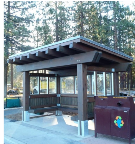
New Shelter (3)