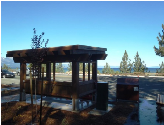
New Shelter (2)