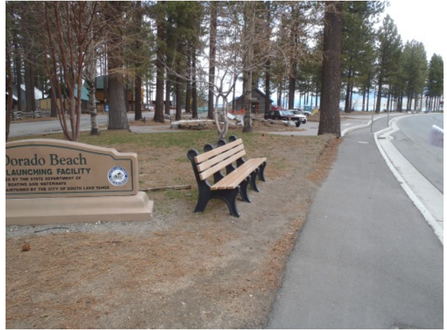
Existing bus stop replaced by new shelter (2)