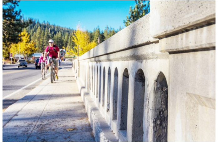
Existing Fanny Bridge