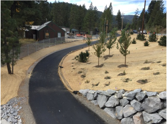
new bike path

The project includes 2 phases that will be constructed separately: 1. Truckee River Bridge Project includes a new, 1,700 foot long section of SR 89 with a new bridge over the Truckee River, and 2 new roundabouts. The project will replace a section of sewer within the project limits. This project was completed in the fall of 2020. 2. Fanny Bridge Project includes replacing the signalized "wye" intersection with a single lane roundabout and replacement of the Fanny Bridge with a new, single span bridge. The construction contract was advertised for bids on 11/20/2023 with a bid opening scheduled for 12/21/2023. Bids/funding will determine what is constructed in 2024 and 2025.