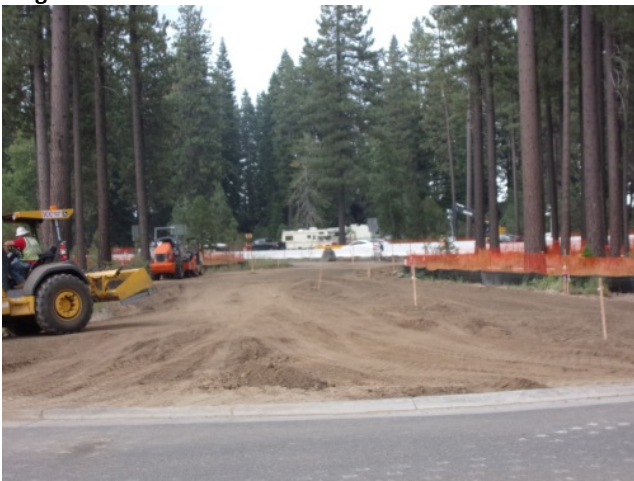
New Entrance to Transit Center