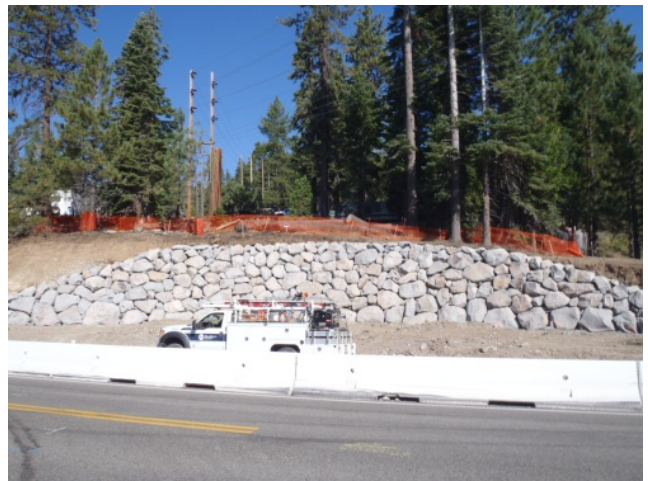
Rockery Wall on SR89