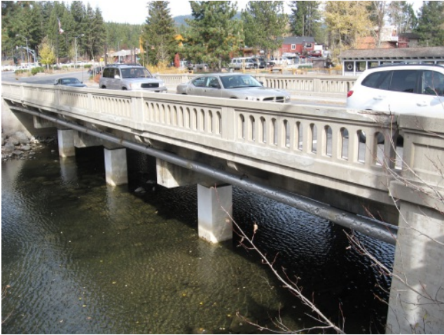
Existing Fanny Bridge