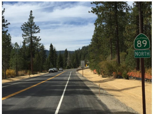
New SR 89