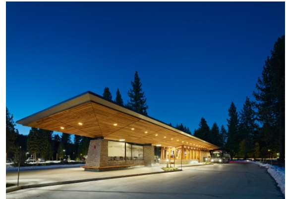
Tahoe City Transit Center

The Tahoe City Transit Center will create a transit transfer/park and ride station in Tahoe City. The project includes a intermodal transit center and associated parking facilities for public use and will include parking for six buses, 130 parking spaces for transit and other uses, an enclosed structure for transit patrons which includes a heated waiting space with bench seating for 40 people and changeable interpretive/tourist displays, public restrooms which will be accessible during all hours of transit operation, an office to provide ticket sales, information and other transit functions, bicycle lockers to encourage intermodal use, and connections to existing bicycle trail systems.