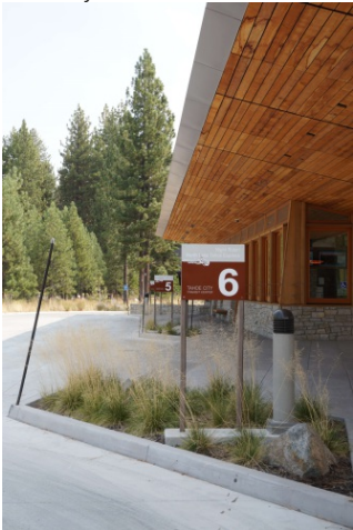
Bus Bay at Tahoe City Transit Center