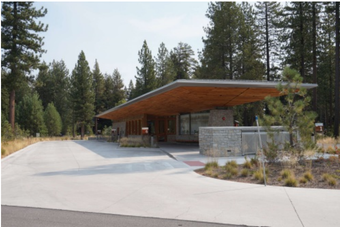
Tahoe City Transit Center