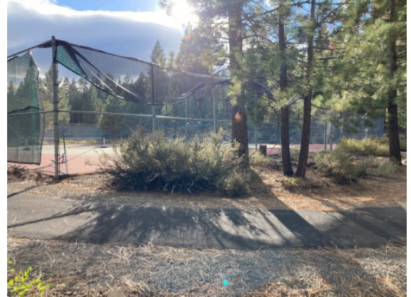
Area adjacent to Pickleball Court to be improved. The Pickleball Court was improved in 2023; but, there was not enough funding to complete the Community Gathering Space at that time.

The project consists of constructing gathering spaces adjacent to the existing tennis and pickleball courts. The project involves concrete curbs, asphalt pavement, pervious pavers, acrylic surfacing, electrical improvements, adding a seat wall, trash enclosure ball backboard, bike racks, interpretive panels, and an art feature from a local artist.