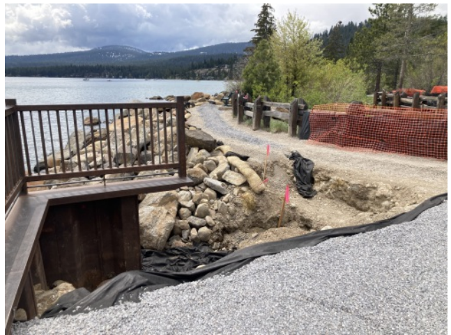
Drain rock for pervious pavers installation on path to peninsula