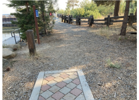
Entrance to dirt and mulch path

This project consists of installation of pervious pavers, rock slope protection, stone seats, metal guardrail modifications, concrete curbs, concrete stairs, utility trench, and other related work necessary to complete the Tahoe Vista Recreation Area Peninsula Improvements.