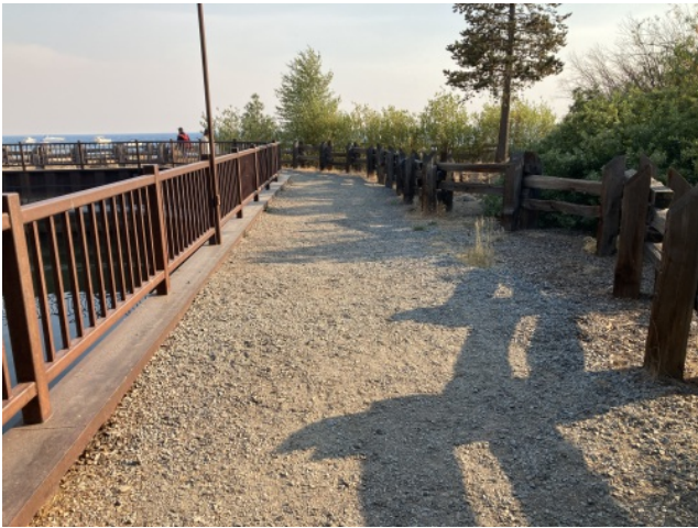
Dirt and mulch path to Bulkhead Overlook