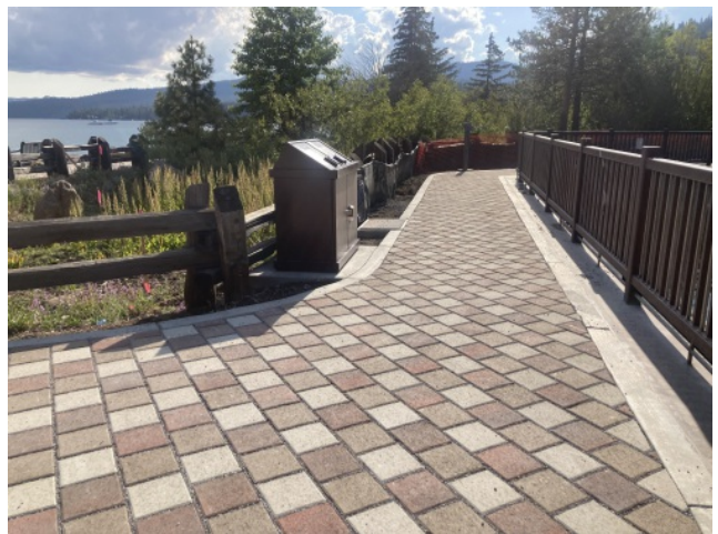
Completed ADA path