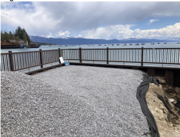
Drain rock at bulkhead overlook in preparation for pervious pavers