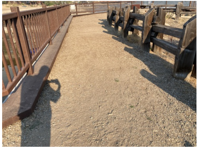
Dirt and mulch path to end of Bulkhead Overlook