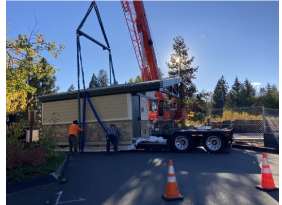
Setting the building

The project will support year-round enjoyment of the Lake Forest Boat Ramp property by replacing the existing, seasonal restroom with an upgraded and year-round, ADA compliant restroom. The new restroom will be a pre-fabricated building with upgraded materials and construction, including indoor plumbing and hydronic floor heating, single occupancy use, vandal resistant locking mechanisms, and refillable water stations.