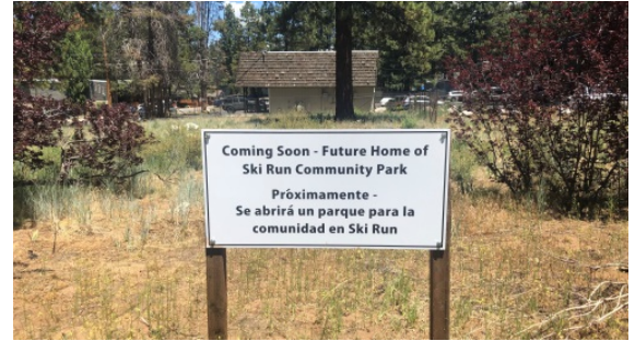
Ski Run Park Coming Soon Sign

The Ski Run Community Park will be located on Ski Run Boulevard in the heart of South Lake Tahoe. The park was once home to the Slalom Inn, which was demolished in 1999. Since then, the lot has sat vacant and served as an unofficial playfield for the neighborhood. In June 2021, the property was acquired by neighboring business owners and fundraising and design began.