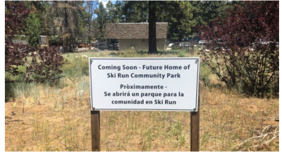
Ski Run Park Coming Soon Sign

The Ski Run Community Park will be located on Ski Run Boulevard in the heart of South Lake Tahoe. The park was once home to the Slalom Inn, which was demolished in 1999. Since then, the lot has sat vacant and served as an unofficial playfield for the neighborhood. In June 2021, the property was acquired by neighboring business owners and fundraising and design began.