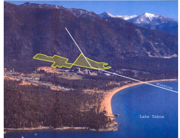
Van Sickle Bi-State Park

This project involves new park improvements at Van Sickle Bi-State Park. Plans currently call for the construction of employee housing and a maintenance shop. Employee housing will provide affordable housing to park employees and allow for rangers to be stationed onsite. An improved maintenance facility will allow park staff to station maintenance personnel onsite. The facilities will be utilized to support future developments at Van Sickle Bi-State Park. Construction is anticipated to begin during the summer of 2024.