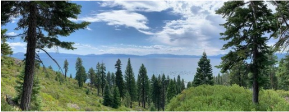
Viewpoint of Tahoe Basin along the proposed trail corridor

Provide formal pedestrian and bike access to the extensive Burton Creek State Park trail system directly from Tahoe City and Tahoe State Recreation Area campground. Tie in with public transit and bike path. Phase 2 will include public Lake Tahoe overlook, picnic area, and pedestrian footpath.