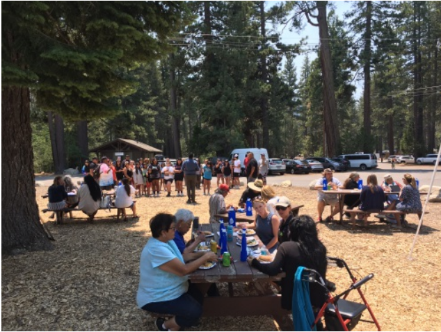
Washoe Tribe Elders Gathering and Discussion Group at Meeks Bay