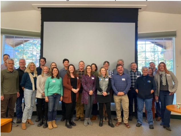
Members of Core Team from public and private organizations

Project Fact Sheet Data as of 06/06/2025