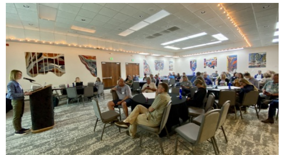
One of eight public workshops held to support the project. Location: Kings Beach