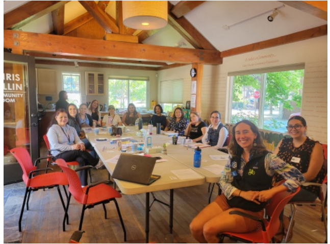
Spanish-speaking Discussion Group in Kings Beach